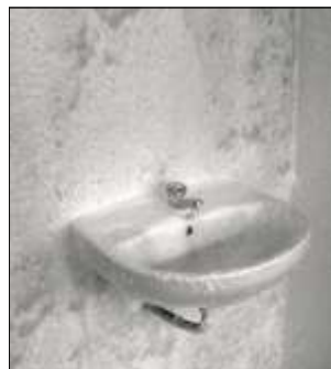
2 Chemical action